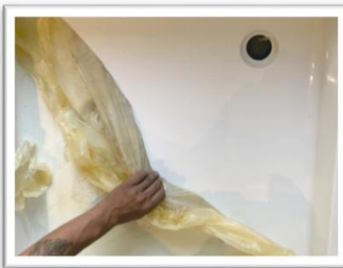
Remove Mask-Off film